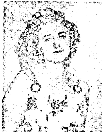
ETHEL ROSENBERG Her appeal argued.

testimony of Rosenberg's political beliefs, including allegations that he had stated he preferred socialism to capitalism. His ideas, the attorney said, were "distorted and twisted" by Saypol to make it appear that Rosenberg had "a predisposition to commit espionage" because of his left-wing views.